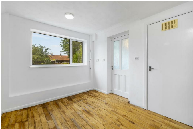
Utility Room 5'9" x 7'4" (1.76m x 2.26m)

utility room. Dining area: 3.50m x 2.57m