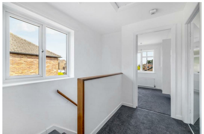
First Floor Landing 7'10" x 7'4" (2.41m x 2.25m)

PVC double glazed window to side. Loft access. Doors to bedrooms and bathroom.